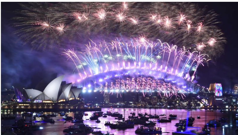
Sydney Port Jackson