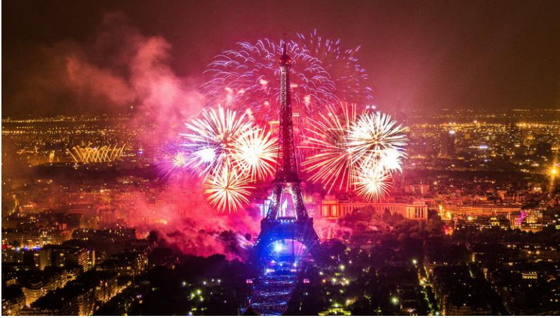
Paris Eiffel Tower