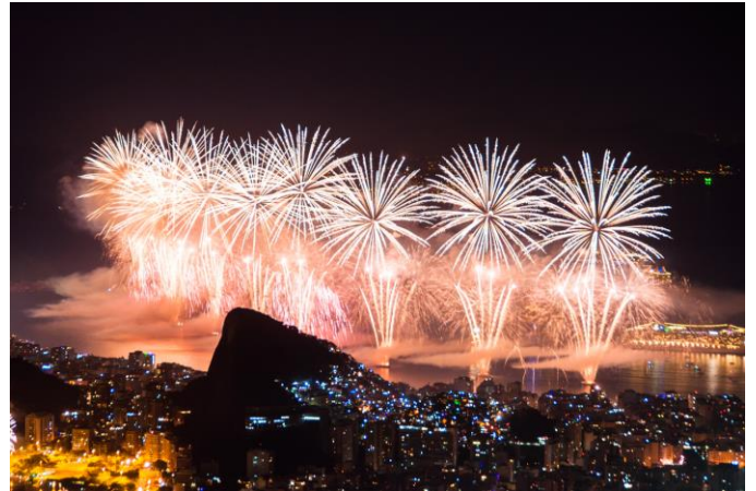
Rio de Janeiro Copacabana